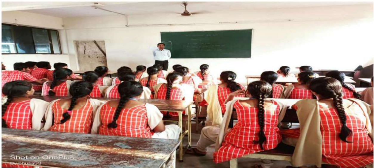
An awareness program on "CAREER GUIDANCE" dated: 17-07-2017