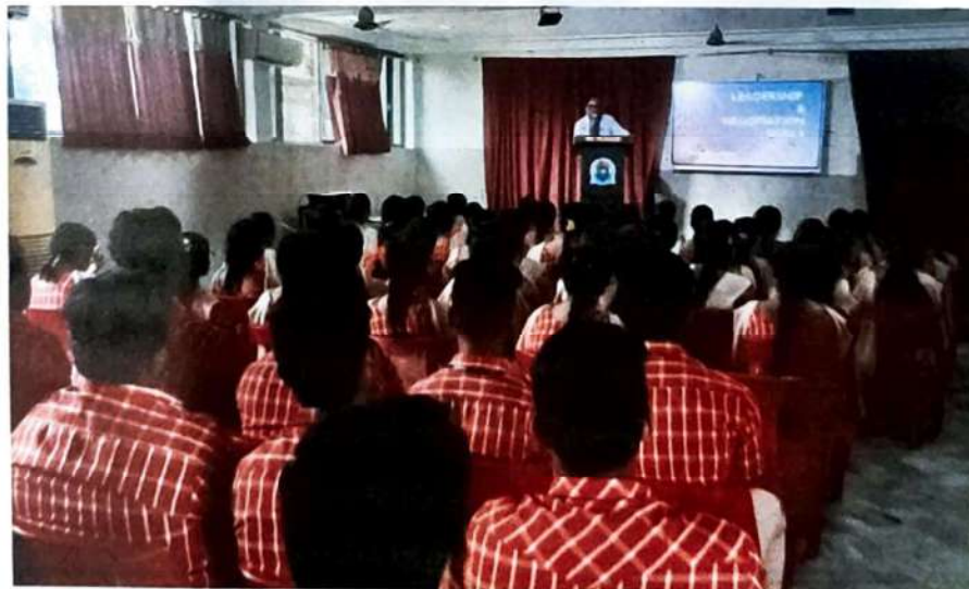
A work shop on "Leadership and Negotiation Skills" dated: 16-08-2018